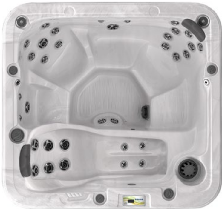
Stereo model shown in Sterling Silver